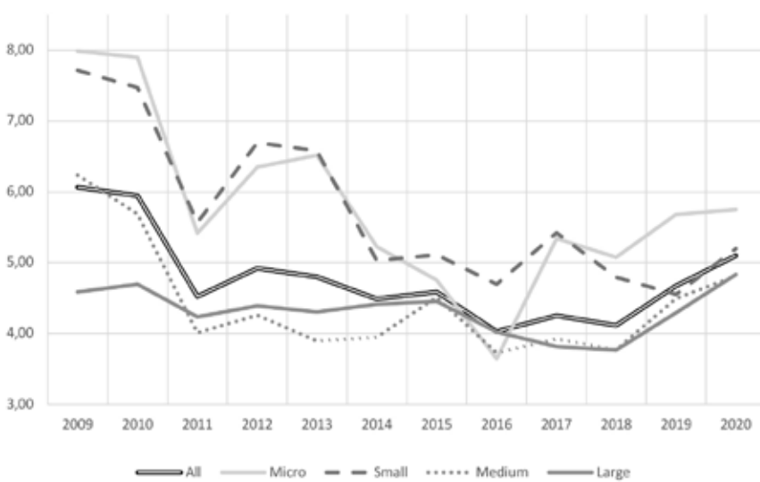
Figure 2: Altman Z- Score for companies of different sizes