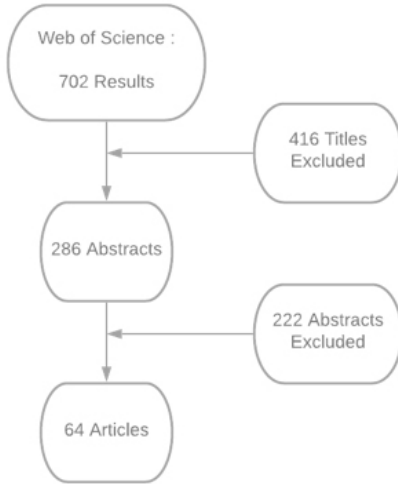
Figure 3: Flow diagram of the article selection process

To select articles, first of all, eliminating the publications that deal with EHRs and EHR functions was determined as a strategy. Then, the determined keywords (EHR, Electronic Health Record, Benefit) and the basic titles given in (Figure 2) were searched. Then, three stages were followed depending on this screening. These stages are shown in (Figure-3). In the first stage, the searched articles were screened according to their titles. In the second stage, the remaining articles were evaluated based on their abstracts. Finally, the full texts of the remaining articles were reviewed. Based on the purpose of the research and the research question, all articles were reviewed so that irrelevant articles were not included. Initially, a comprehensive review of 702 articles was conducted. Each article was examined according to the concepts used and measured results, and at the last stage, 286 articles were determined. Nine studies directly addressing the EHR and 55 studies addressing the functions of the EHR were found.