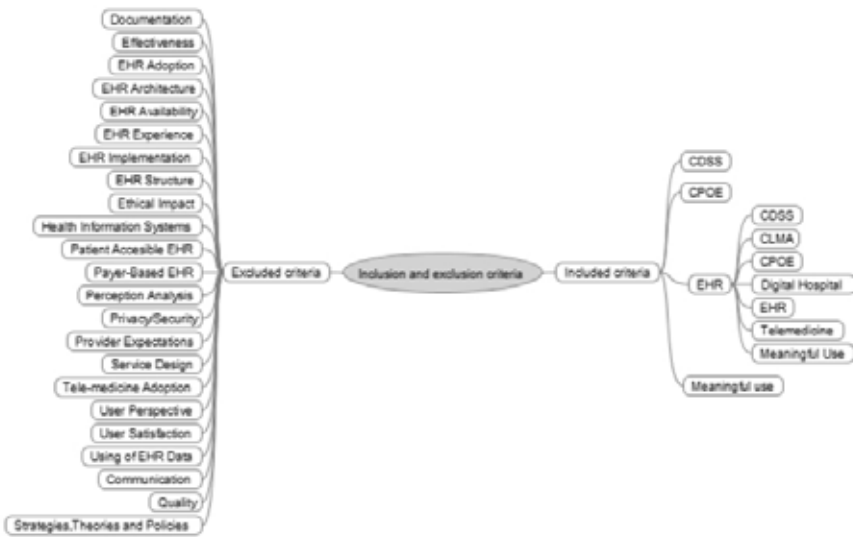
Figure 4: Search Strategy and Include/Exclude Criteria

Inclusion and exclusion criteria were determined for 286 publications due to the initial search after the first title-based screening. These criteria are given in (Figure 4). The inclusion criteria for the publications are that the main subject or the subject they put forward is related to EHRs and EHR functions. EHR functions are specified as CDSS, CPOE, EHR, and Meaningful Use. Exclusion criteria are that the main subject and the issue raised are not directly related to EHRs or EHR functions. A direct relationship was not found with the EHR or EHR functions of 416 studies obtained by using these criteria. For this reason, these studies were not included in the scope of the research. After this screening, 286 studies were evaluated according to their titles, and 64 studies directly related to the purpose of the literature review were included in the study.