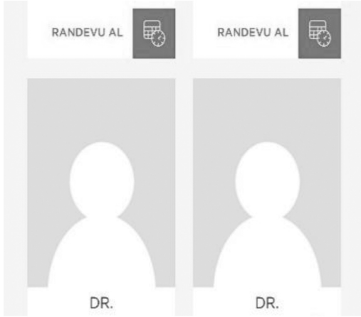
Figure 2. Make an Appointment System Display on the Doctor’s Screen

3. If the doctor appointment slots are full, the “Call Me” system has been created, where patients will leave records.